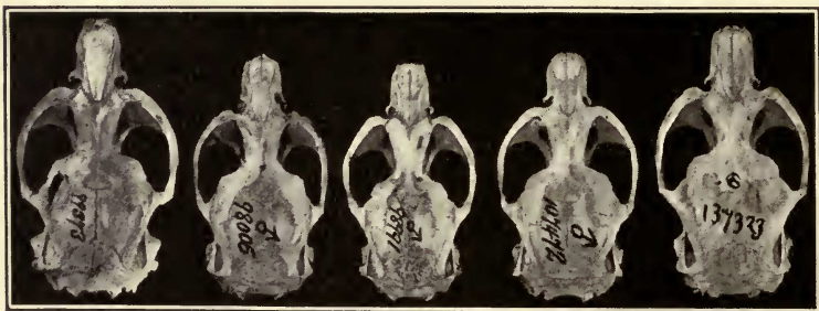
SKULLS OF Microtus operarius GROUP.

Remarks. —This insular form differs from its mainland relatives chiefly in decidedly larger size. It belongs to the so-called " operarius group" which properly includes, besides a number of Alaskan forms, several of wide distribution in Eurasia. Representatives of this group doubtless entered Alaska from Asia at a time not very remote, for although a number of Alaskan forms are now differentiated, all are very closely allied and none show any marked departure from the Asiatic forms. The one here described seems as worthy of specific rank as any of the others but the amount of cranial variation in all the forms and the general uniformity of coloration leads one to believe that they might well be ranked as subspecies. If this were done, however, M. oeconomus , M. kamschaticus , and probably M. ratticeps ought to be included as they differ from M. operarius and other Alaskan forms only very slightly.